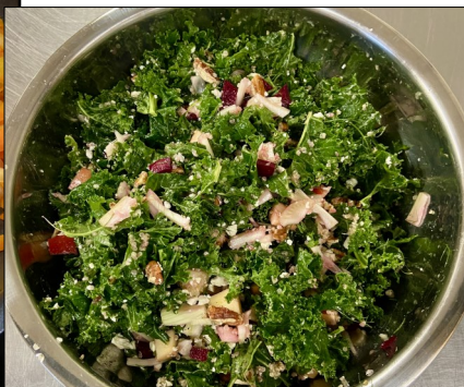
Fall Vegetable Salad