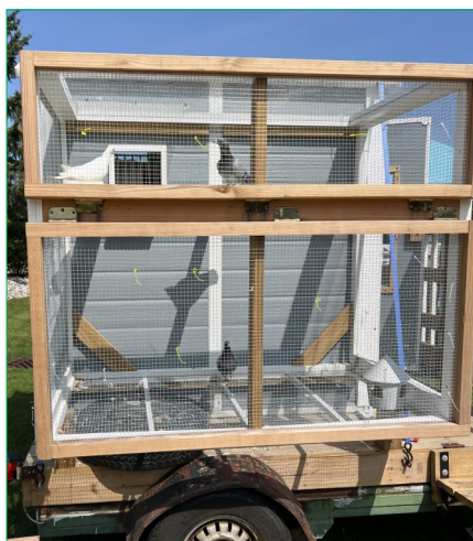
Flying Clover Club racing pigeon loft