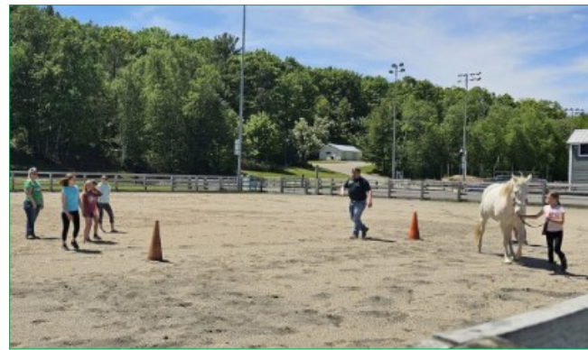
Youth practicing new skills and improving 4-H projects whether in or out of doors.