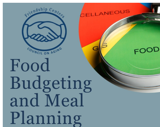
Program at Petoskey Friendship Center