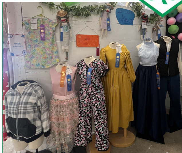
Award winning 4-H still-projects—clothing designs