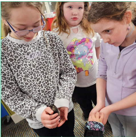
Participants enjoyed holding the new chicks

Emmet County 4-H partnered with Petoskey District Library to bring embryology to the library during the month of March. A table was set up in the library with incubators, information and a display. Two to three times a week, a 4-H volunteer provided education to members of the SPIN (special interest) club. The project brought much excitement to the library! Library staff said this project was just as exciting for the adults as it was for the kids. According to the Petoskey District Librarian, hundreds of visitors stopped by to look at the eggs.