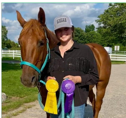
Award winning equestrian