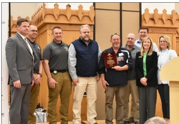
The City of Cheboygan was awarded the “Guts and Grit Award”