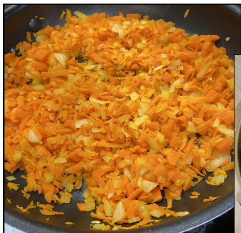
Sauce for a Hearty Vegetable Pasta

Jump Into Food & Fitness is a research-based curriculum for youth in grades third through fifth with fun nutrition, physical fitness and food safety learning activities.