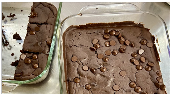
Black Bean Brownies made by the LTBB Cooking Matters for Adults class

Cooking Matters for Adults shows adult participants a wide variety of budget-friendly recipes, with participants making a new recipe each week.