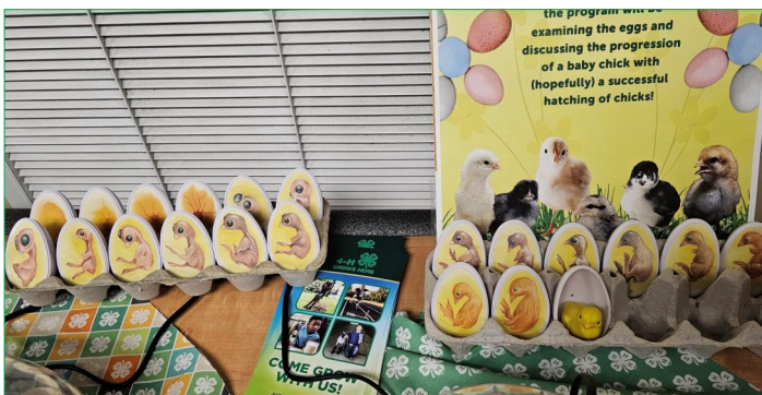
Interactive Display at the Chicken Hatch-A-Long

“The fourth chick, Junior, started poking out just before 4 p.m. and the table was surrounded by enthusiastic kids chanting, ‘Let’s go, Junior! You can do it Junior!’ Finally, Junior emerged and the kids started cheering and clapping. The excitement carried throughout the library! It was a wonderfully fun day for kids, parents and especially library staff!”