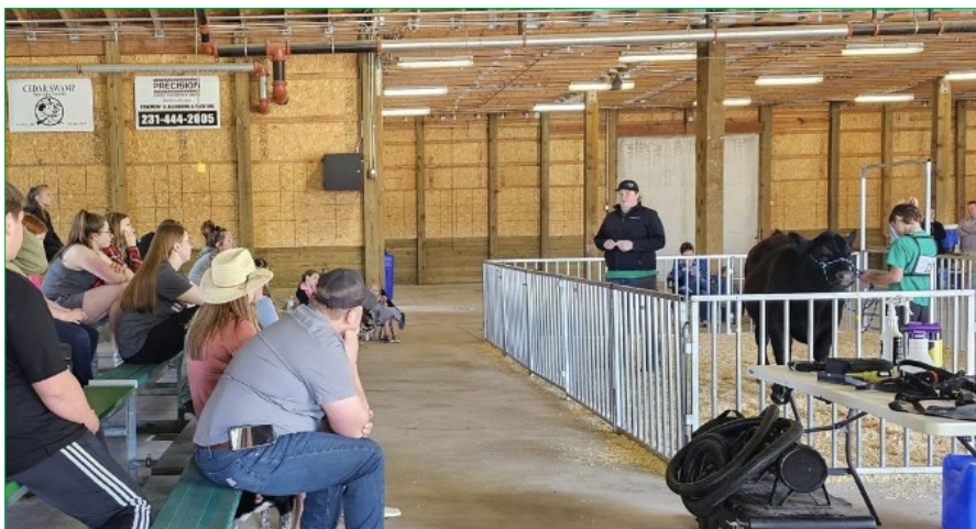
Two examples of hands-on learning about animal health and veterinary science.