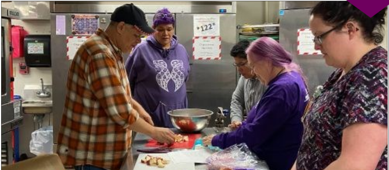
Cooking Matters series participants prepare produce for a recipe.