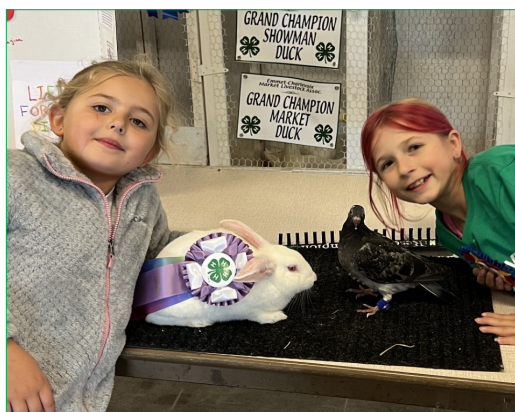
Rabbit and pigeon in the small animal category