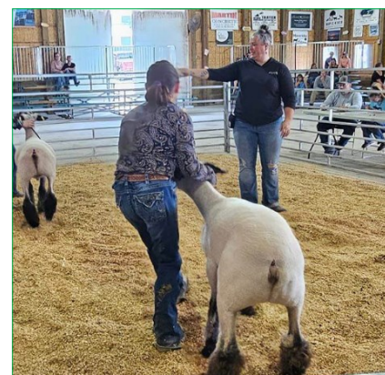
Livestock showing and auction