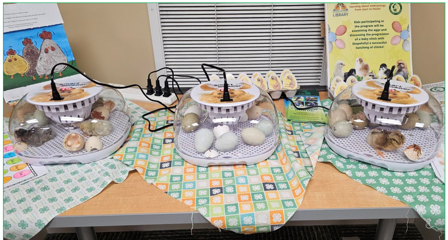
Incubators set up at the Petoskey District Library