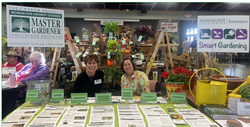
Master Gardener booth at the Fair

Master Gardeners are a group who train and certify volunteers to be able to educate the public about gardening and improve their communities through horticulture related volunteering projects.