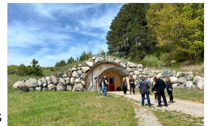
Tour participants allowed a rare look into the cheese cave at Leelanau Cheese